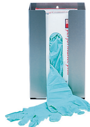
Glove Box Holders