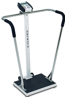
6855 Waist-High Scale with Handrails