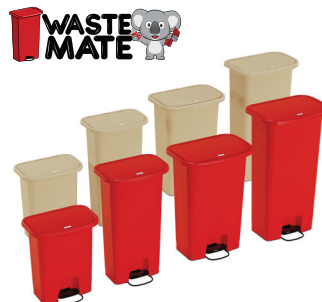
Plastic Waste Receptacles