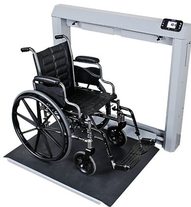
7550 Wall-Mount Fold-Up Wheelchair Scale