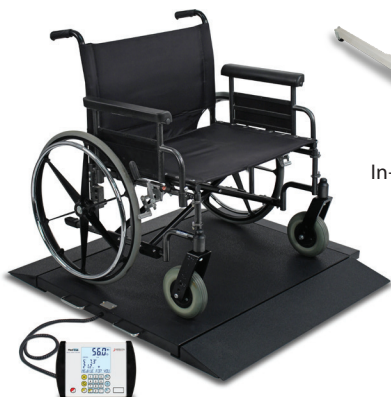
BRW1000 Portable Bariatric Wheelchair Scale