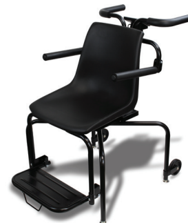
6880 Rolling Chair Scales