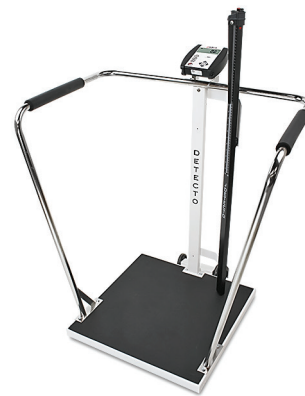
6856MHR Waist-High Scale with Mechanical Height Rod