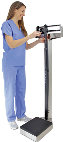
439S Stainless Steel Physician Scales