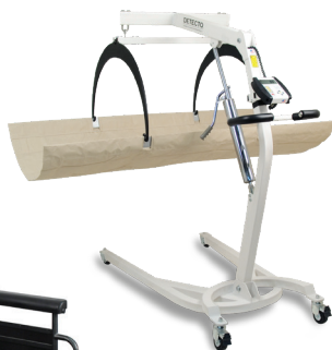
IBFL500 In-Bed Scales