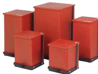
Biohazardous Waste Step-On Cans