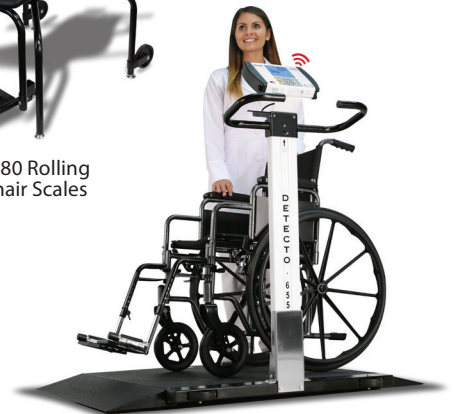
6550 Portable Wheelchair Scale with Column Indicator

These DETECTO products are TAA compliant.