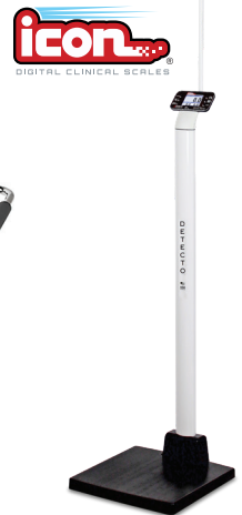
icon ® Digital Physician Scale with Sonar Height Rod