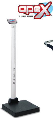
apex ® Digital Physician Scale with Inline Height Rod