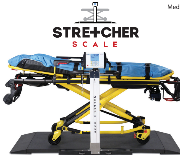
8550 Portable Stretcher Scales